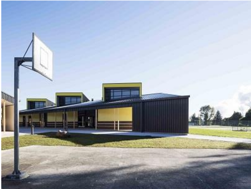
Tarawera High School