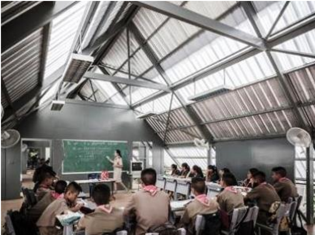
Baan Huay Sarn Yaw Post-Disaster School