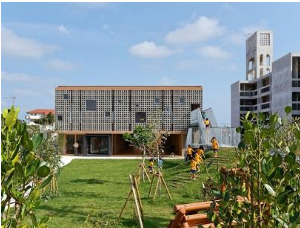
Hanazono Kindergarten and Nursery