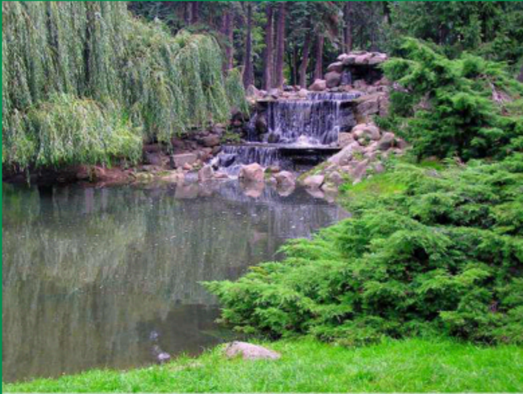
ON THE PHOTO IS WATERFALL,