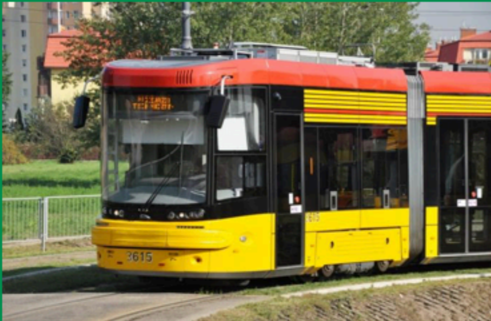
THE PICTURE SHOWS A TRAM FROM WARSAW.

YOU CAN GO TO SKARYSZEWSKI PARK ON FOOT, BY BIKE, BY SCOOTER, BY TUBE, BY TRAM OR BY TRAIN. THERE ARE TWO LINES OF TRAMS THAT YOU CAN USE TO GET HERE: LINE 9 AND 24. YOU CAN ALSO TAKE A BUS TO THE PARK BY 102, 521, 158.