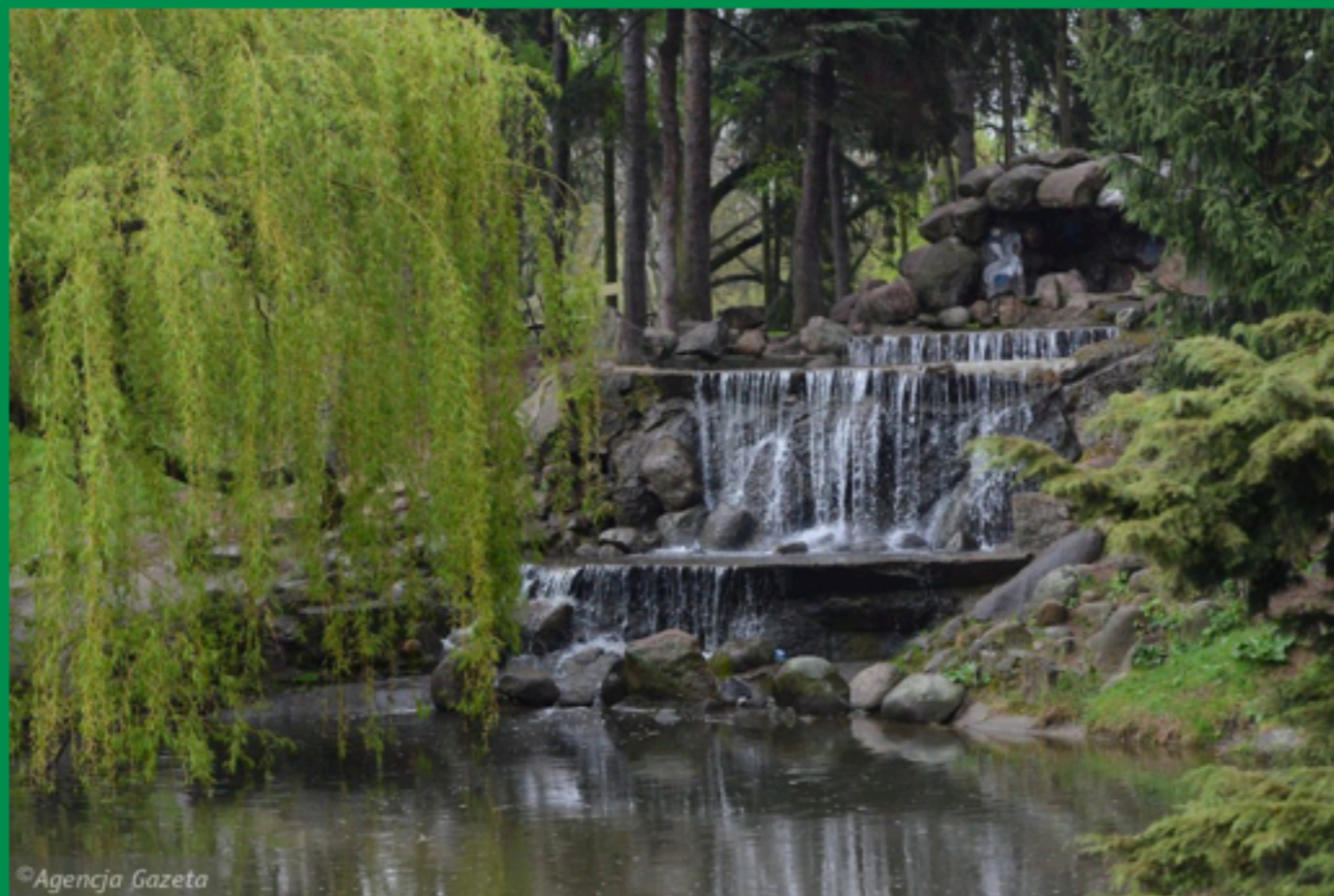
SMALL WATERFALL, GAZETA WYBORCZA WARSAW, POLAND