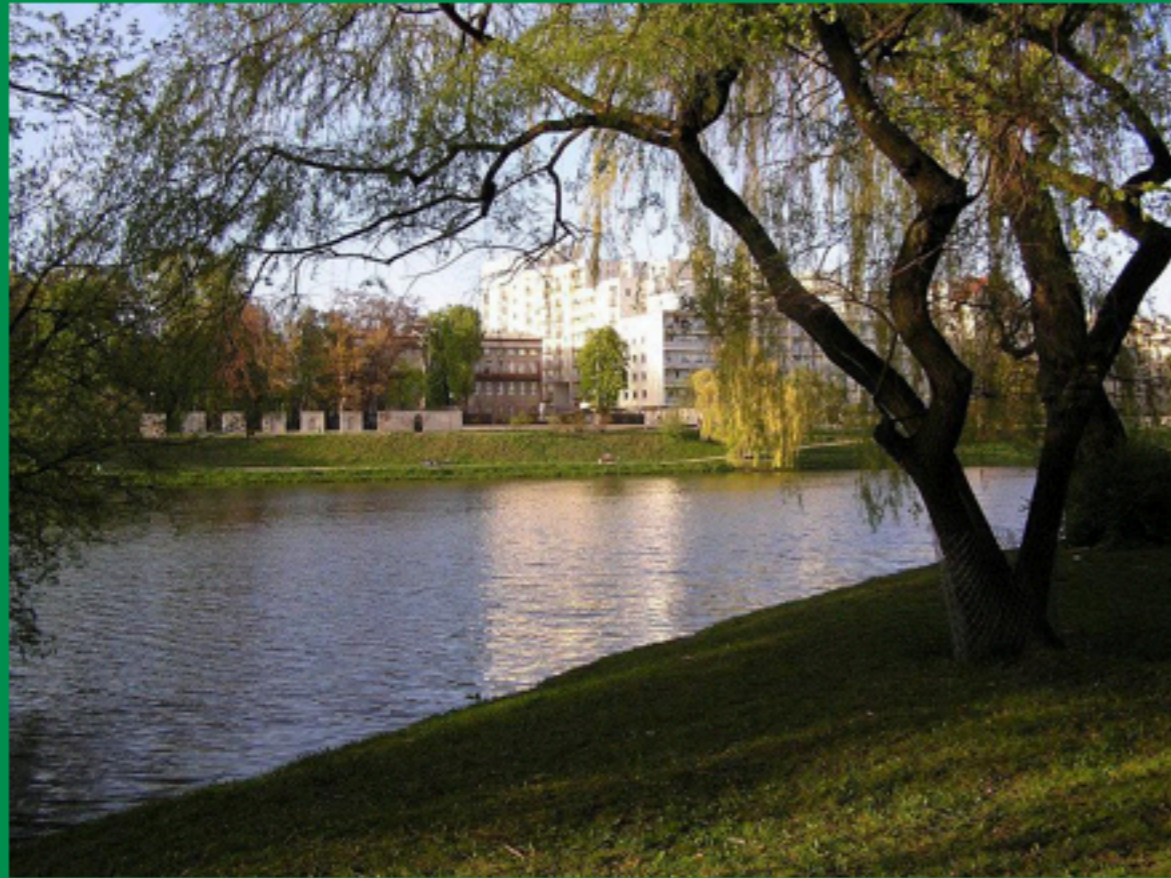
THIS PICTURE SHOWS KAMIONKOWSKIE LAKE HTTPS://TINY.PL/TK2NK

PEOPLE ENJOY THE PARK IN ALL THROUGH THE YEAR. SKARYSZEWSKI PARK HAS MANY INTERESTING PLACES AND ATTRACTIONS FOR SPENDING TIME. YOU CAN LAY HERE ON THE GRASS AND CHILL. THIS PARK IS PERFECT FOR RUNNING, NORDIC WALKING AND CYCLING. THERE ARE MANY EVENTS LIKE OPEN AIR RUNNING TO CELEBRATE NEW YEAR. EVERY YEAR THERE IS SOME INTEGRATION CLASSES